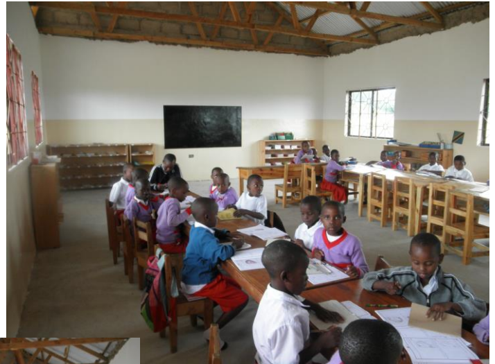
Year 3 students in new classrooms

Tugo's social responsibility team voted unanimously to get behind this project to ensure these new classrooms were completed! Thanks Tugo!