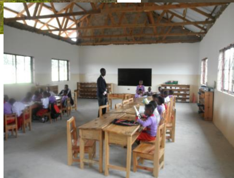
Reading and writing at school

Tugo's social responsibility team voted unanimously to get behind this project to ensure these new classrooms were completed! Thanks Tugo!