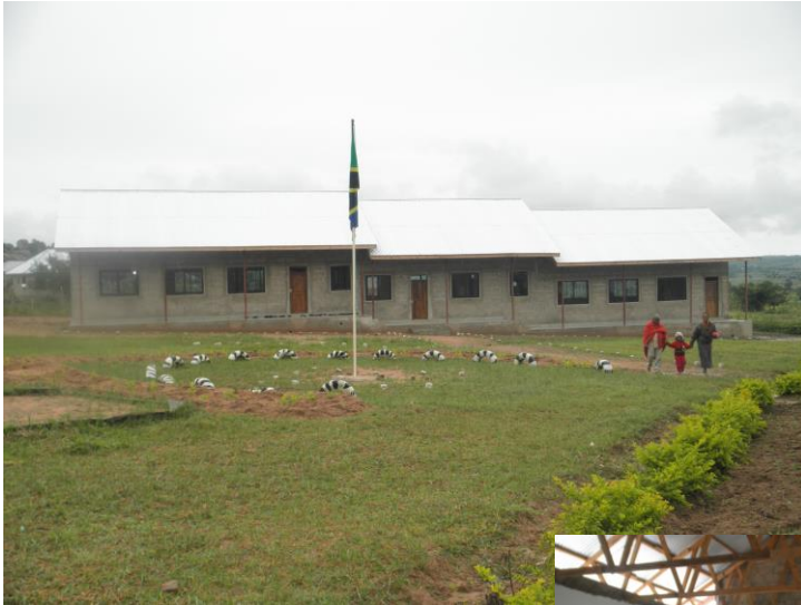
Exterior of new finished classrooms

After... and here it is by August 2015 with floors, roof, doors, windows and interior completed and class in session.